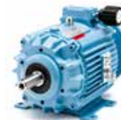
K4 (1,1-1,5 kW)