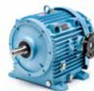
15 (3-4 kW)