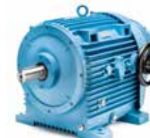
17 (15 kW) 17B (22 kW)