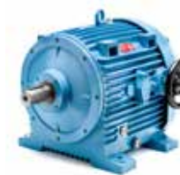
16 (5,5-7,5 kW) 16B (11 kW)