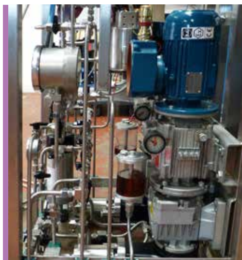
K2 variator on chemical sector pump