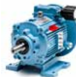
K2 (0,37-0,55-0,75 kW)