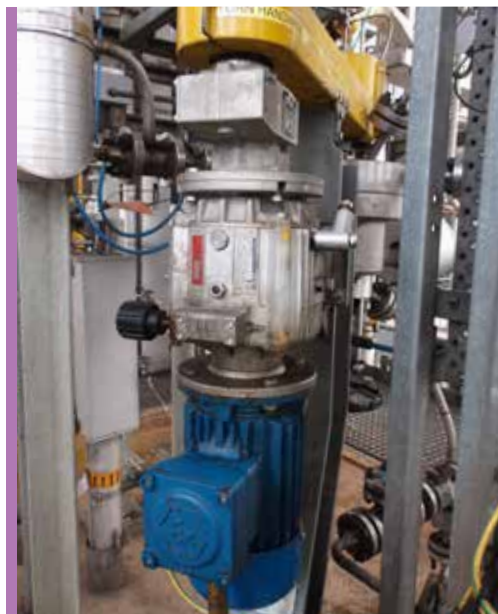
K4 variator on oil sector mixer