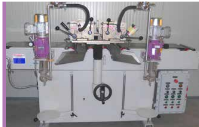
Curtain coaters: K2 variator on dosing pump