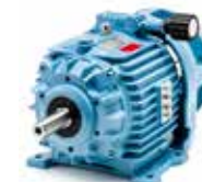
K5 (2,2-3-4 kW)